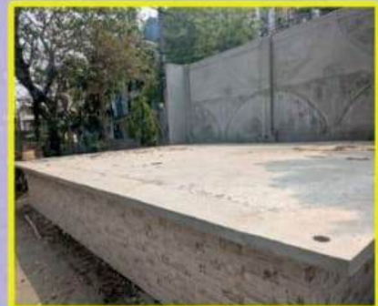
NEWLY CONSTRUCTED OPEN STAGE