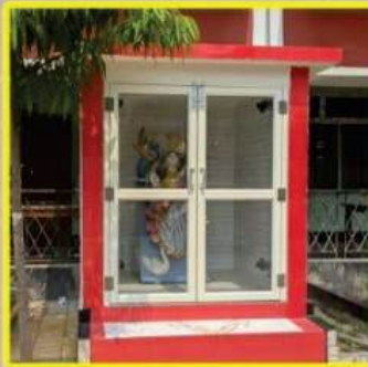
SARASWATI IDOL ROOM