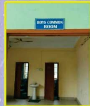
BOYS COMMON ROOM