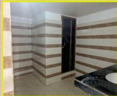
NEWLY RENOVATED BOYS' WASHROOM