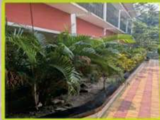
PAVEMENT CUM SITTING AREA FOR STUDENTS